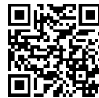
WHA FACEBOOK PAGE