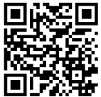
WHA FACEBOOK PAGE