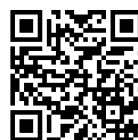
WHA FACEBOOK PAGE