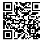
WHA FACEBOOK PAGE