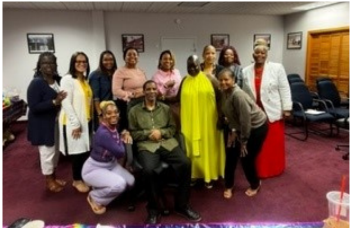
Pictured Above: WHA Housing Choice Voucher Team at the Color Party

In June, WHA's Housing Choice Voucher Team hosted their color themed monthly meeting. During the meeting, the team discussed their goals and objectives for the upcoming month. The Housing Choice Voucher Team used the time to celebrate their achievements and team building. Each member of the team wore their favorite color and brought snacks that matched the color they were wearing. The team also had sandwiches from Capriotti's. A great time was had by all.